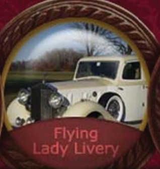
Flying Lady Livery